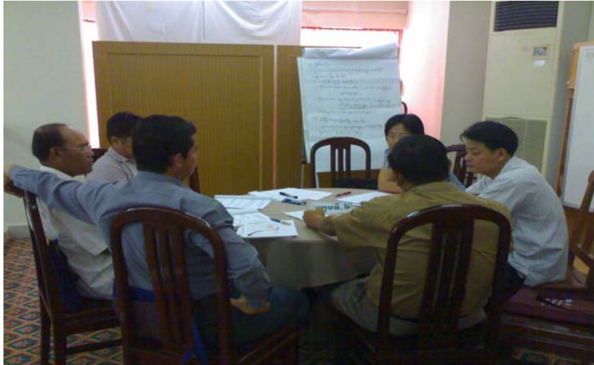
Memo Group Discussion of National Forest Programme strategic framework No.7